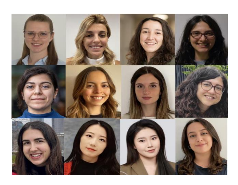
Photos of the YW4OR 2024 awardees in order of the list: from left to right and from top to bottom